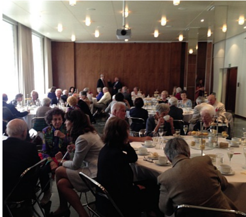
For further information please visit: www.swissbenevolent.org.uk