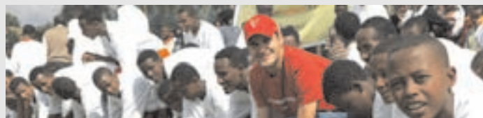
Below: Roger Federer visiting his African projects RFF