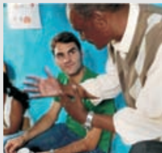
Above: Federer supports projects in four African countries RFF

While Zimbabwe once boasted one of the best education systems in Africa, the current economic collapse and political unrest has driven many teachers away, leaving many schools closed or simply gathering places for unwillingly idle children. Thanks to ETAS, this has not been the case at Matopo Primary School. The Teacher-to-Teacher project at Matopo Primary began with the basics: uniforms for the neediest pupils, text books, materials and teacher training. The other schools in the region are also in desperate need of this kind of help.