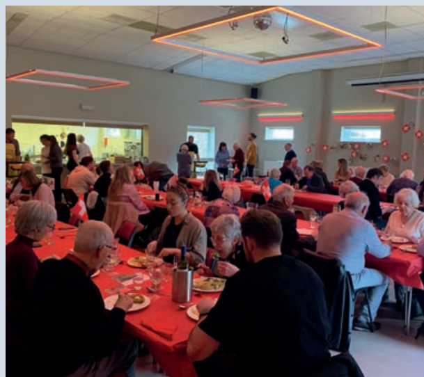
Raclette Party on Sunday, 13 th March 2022 at the Brookdale Club.