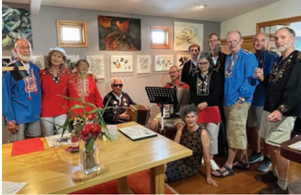
Yodel Choir &amp; Folklore Group 'Baerg-Roeseli' in Brisbane...