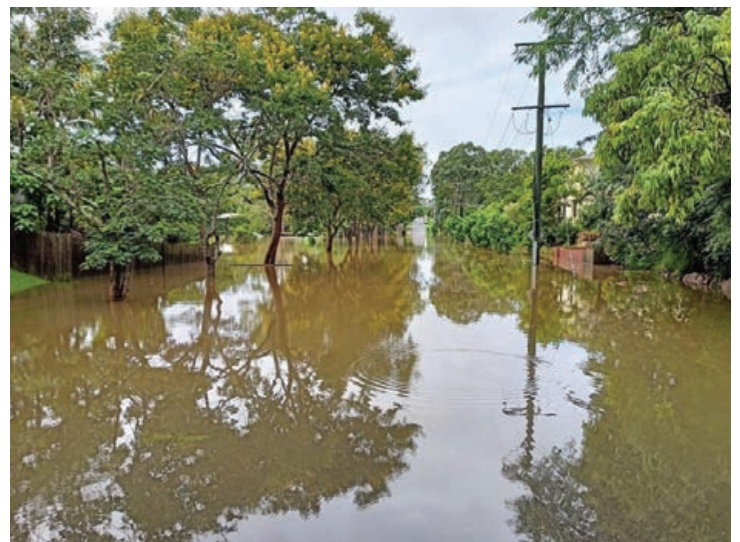
...was transformed into a river within two hours!