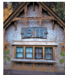
Edelweiss Village Homes