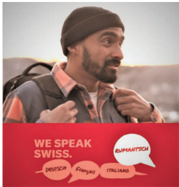
Snook © Tanja N. Maikoff | Infographie © DFAE