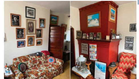
Edelweiss Village - Interior Views

housing for the Swiss allowed the guides to relocate their families to the Village in Golden and dispense with the yearly commute.