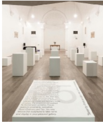
An arts exhibition.