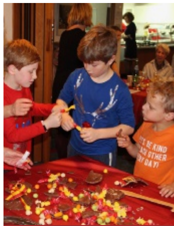
The annual Escalade with NSH.