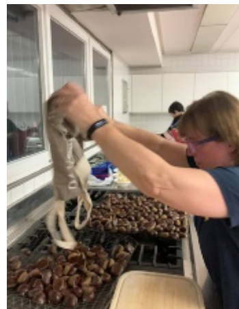
Castagne ready to be roasted.