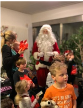
Children with San Nicolao.

For more information about club's events please contact: sasc@ntsc.plus.com