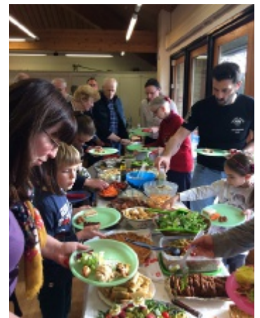
People enjoying a rich buffet.