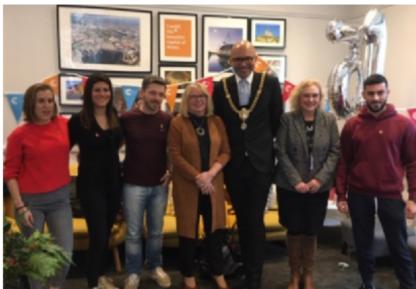
The first four Swiss students, with the Swiss Honorary Consul in Wales, Rt. Hon. Lord Mayor of Cardiff, Cardiff Council and The Head of International Affairs, Welsh Government.

It is anticipated that for the next two to five years up to 50 Swiss nationals will study English in Cardiff and experience Welsh life and culture every year. The value of the contract is CHF 1.8m (GBP £1.4m) and the contract for the first 2 years.