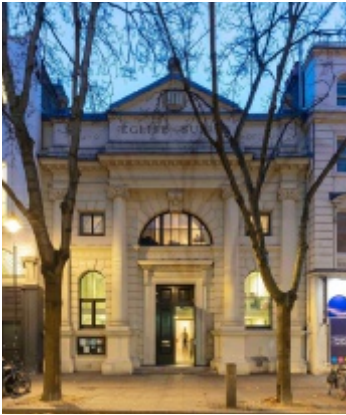
Swiss Church facade.

Church's webpage: www.wisschurchlondon.org