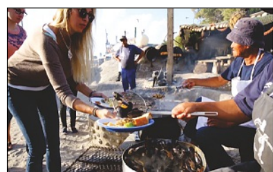
Culinary journey through Cape Town

If you ever feel South Africa is not the coolest place on earth, just take a look at what these Swiss tourists experienced in their travels through the Western Cape. The video “Food Safari Cape Town – Where Food Lovers Dreams come true”