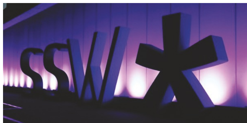
Seedstars connects startups from emerging markets with investors