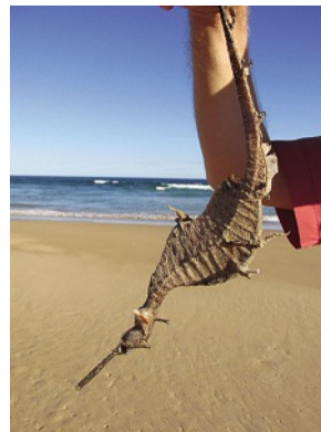
Canberra Swiss Club Coast weekend