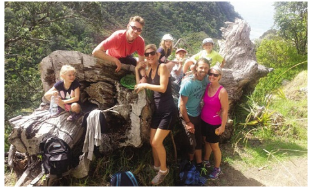
lunch break at the coromandel walkway

dition against the Auckland Club. The shooting had already been won by Auckland and it looked as if the bowling was all in their favours, but the last couple of Hamilton bowlers made all the difference. It all came down to the card playing where Hamilton managed to win, so now the Hamilton Club will make their way to Wellington on Queen's Birthday weekend for the final against the Taranaki Club.