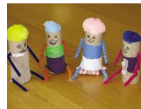
Swiss Play Group toilet paper roll people event is on May 29

This year we went camping at Glenworth Valley near Gosford, a fantastic location for a few families to get together! We built and strengthened friendships, explored nature and enjoyed the camp fire! We cooked up a storm on the BBQ: Sausages, Ice-cream cones with melted Mars bars and fruit, Brownies, Schlangenbrot/Damper and of course not to forget the giant marshmallows! And guess what: It was lots of fun and none of the kids asked for electronic devices once!