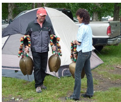
Preparation for Alberta-Swiss Landsgemeinde