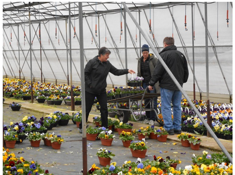
...and at Huron Ridge Acres for grand-scale potting and planting insights