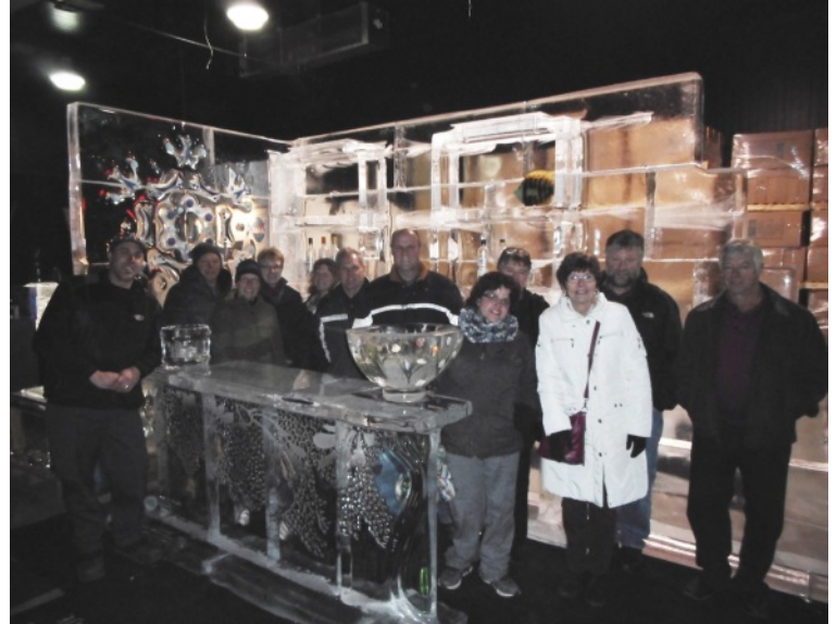
Visit at Ice Culture with guided tour exploring ice sculpting...