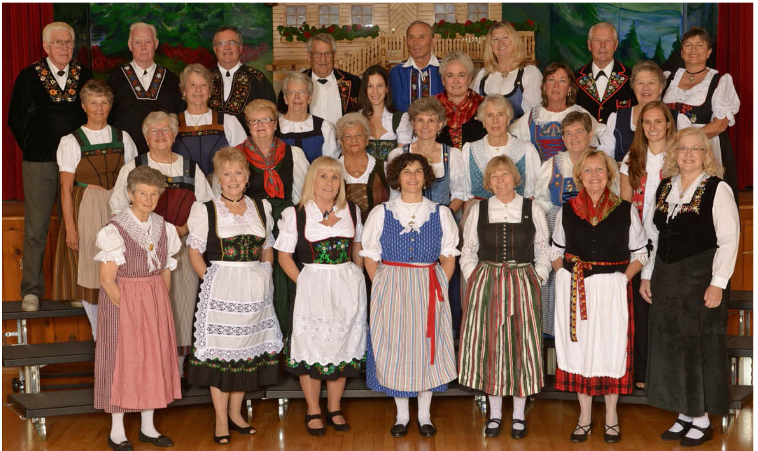
The San Joaquin Valley Swiss Echoes are looking forward to seeing you at the Swiss Singing and Yodeling Festival in 2017

SWISS SONG FESTIVAL 2017—P.O. BOX 583001, MODESTO CA 95358