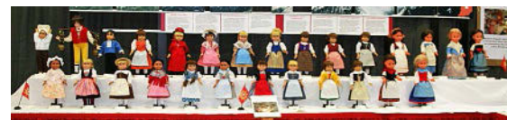
The Swiss booth, with all the dolls dressed in typical Swiss costumes.

light on Saturday night was a parade of nations of festival participants led by a