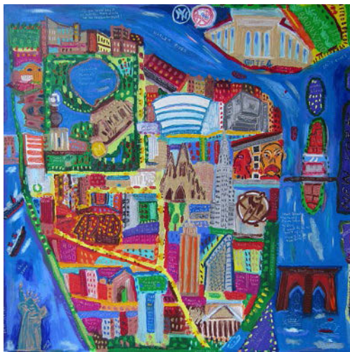
Impressions of New York