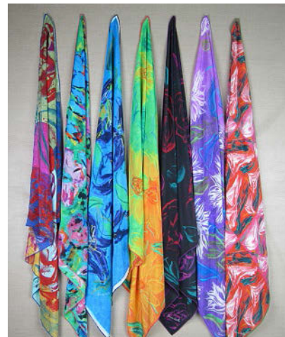
Wearable art: Silk scarves, one for every day of the week!